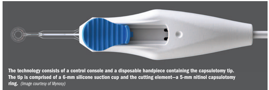
The technology consists of a control console and a disposable handpiece containing the capsulotomy tip. The tip is comprised of a 6-mm silicone suction cup and the cutting element—a 5-mm nitinol capsulotomy ring.

Serial slit lamp examination in the animal eyes showed no differences comparing eyes that underwent PPC and fellow eyes in which capsulotomy was done using manual continuous